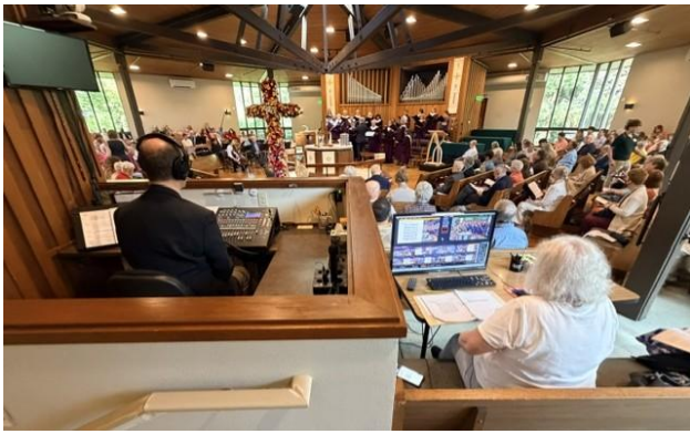
Thanks to our audio/video teams!