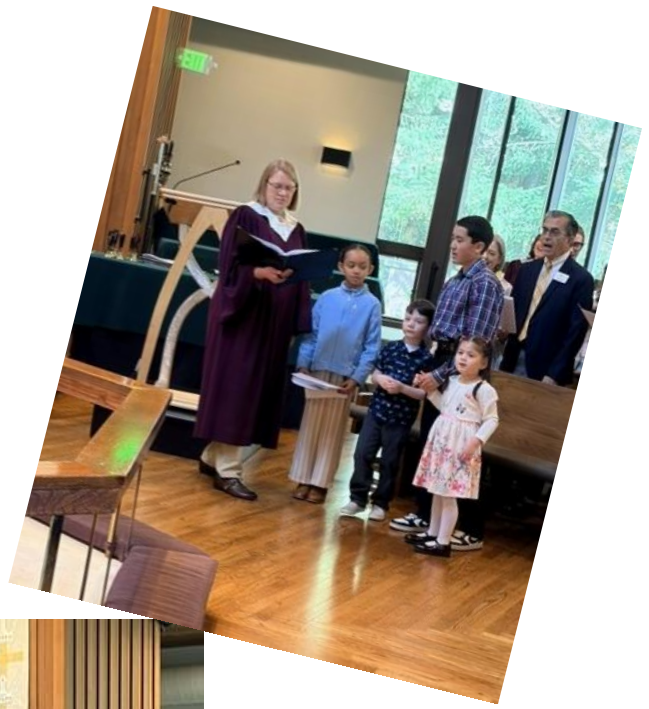
Choir, pastor, assisting minister – kids leading the sending.