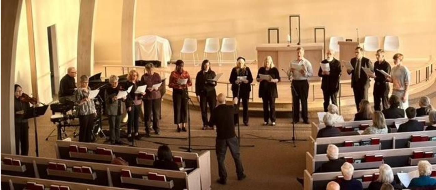
Our ELCC pastors and combined choir!