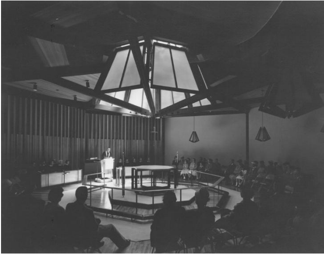
Worship at the NEW Saint Andrew's Lutheran Church