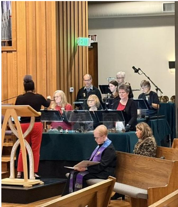
Maundy Thursday - Bell Choir, Stripping of the Altar