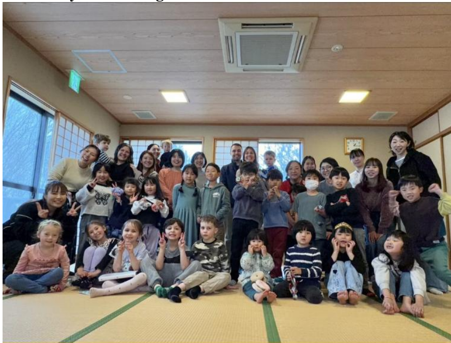
We could feel the kindness of the moms who planned a going away party for us

It is hard to say so many goodbyes to neighbours and kindergarten families as we prepare to move to Yokohama April 1. We are sad to move from here where many people have been so kind to us at a time when we were vulnerable. Likewise, many of them entrusted us with their lives' concerns. Nevertheless, we are comforted by and confident in God's sovereign and perfect will. We know that the promises of Romans 8:29-30 are true and guaranteed by the atoning work of Christ.