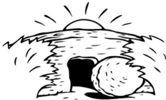
"He has risen! He is not here." Mark 16:6