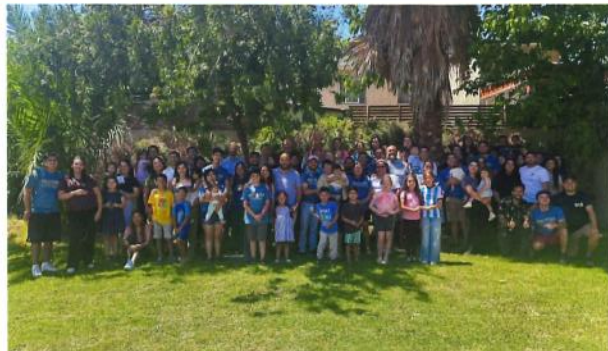
Pastors and their families in Chile