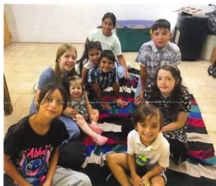
Sunday School Class at Faith Baptist

Continue to pray for my rehabilitation of my shoulder. Therapy is coming along slowly, but I am making some progress and regaining mobility in my shoulder. Also pray for this month as we are moving from the northern part of Rosario to a town called Alvear, which is located to the south of the city. This will cut about half an hour off of our trip to Pergamino (currently it takes an hour and a half) where Faith Baptist church is located, and will place us about 15 minutes from our camp in Alvarez.