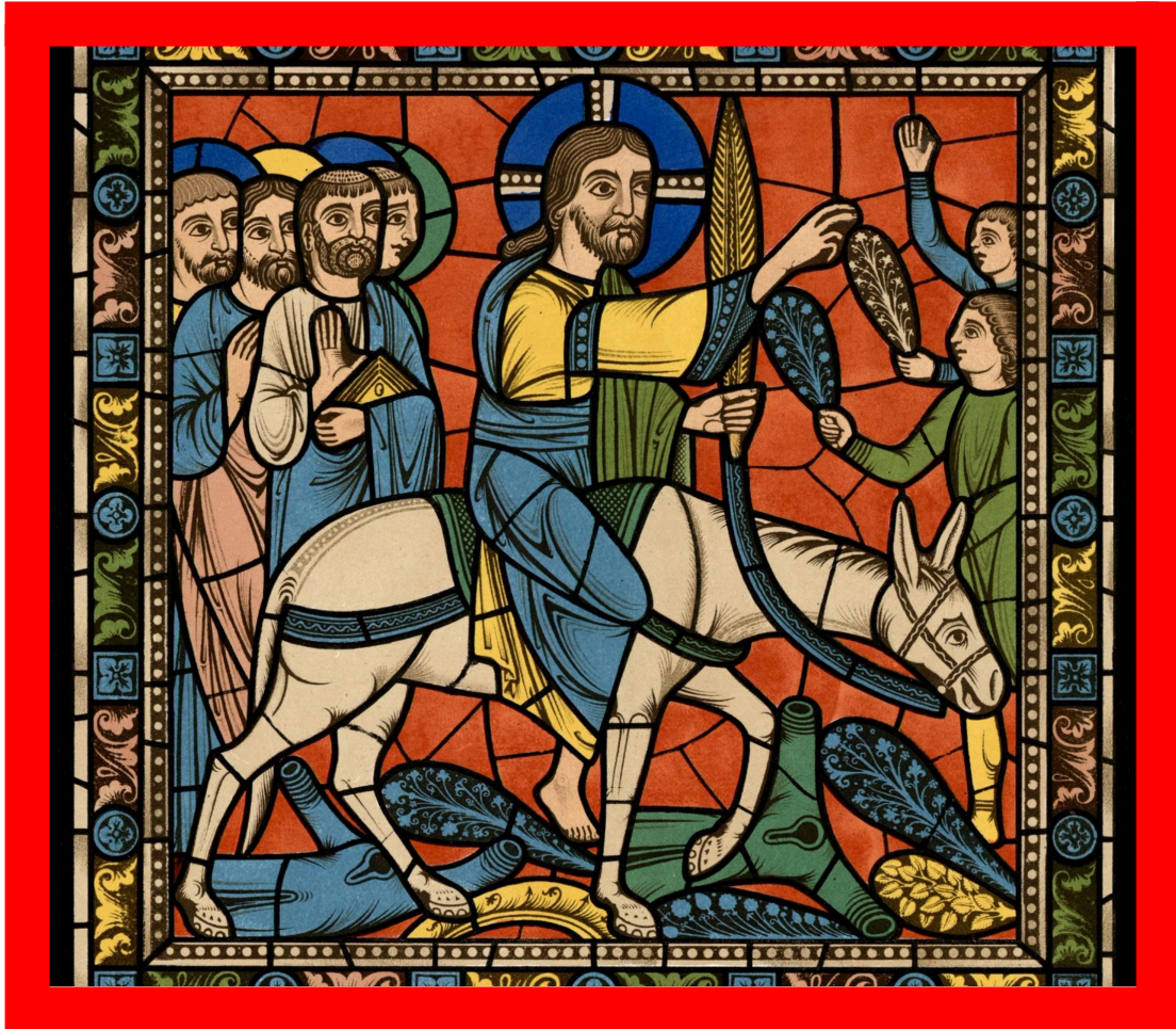
Image: Detail of stained glass window: The life of Jesus - Chartres Cathedral - public domain