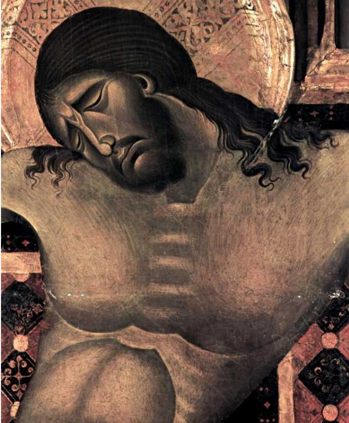
Christ, detail from the crucifixion Painting by Cimabue, 1268-1271

The 5th Sunday in Lent A Service of the Word