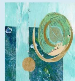
FEATURED ART BY LOIS JUSTABO

LOCAL ARTISTS DONATING A PORTION OF THEIR SALES