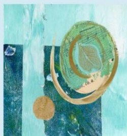
FEATURED ART BY LOIS JUSTABO

LOCAL ARTISTS DONATING A PORTION OF THEIR SALES