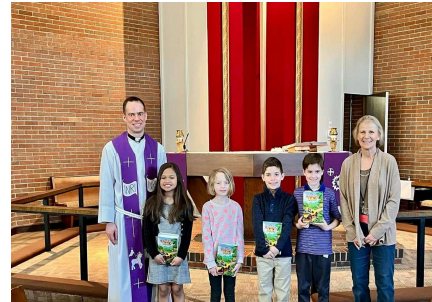
First Bible Class

Thanks to the many volunteers and the support of the congregation, opportunities to grow in faith through learning abounded this year at Grace. The children had the option of attending Sunday school, VBS, first Bible class and first communion class. Teens attended confirmation class and adults had several Bible studies to choose from.