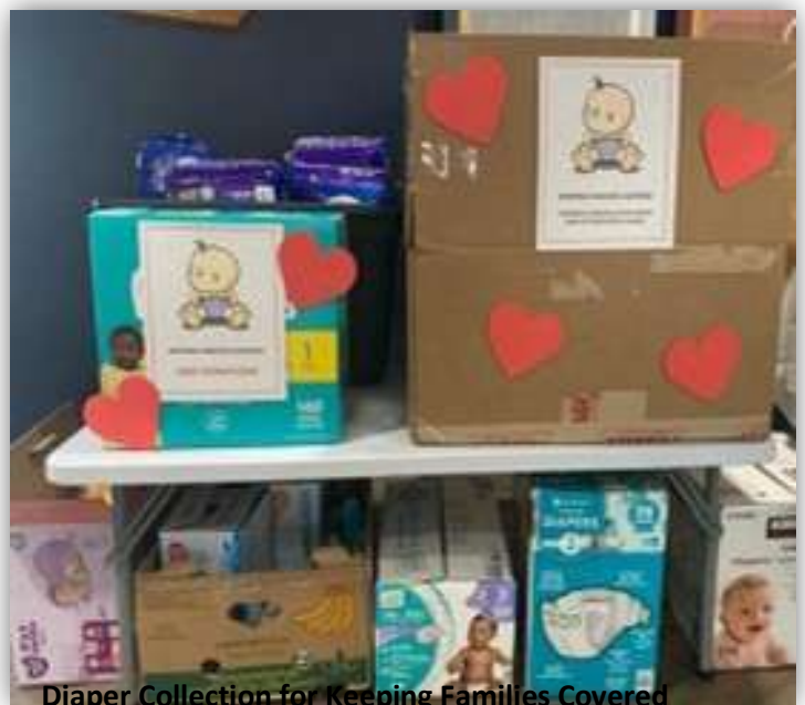
Diaper Collection for Keeping Families Covered