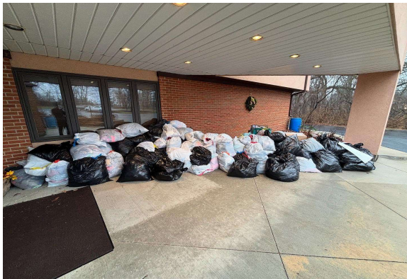
Clothing Drive for AmVets