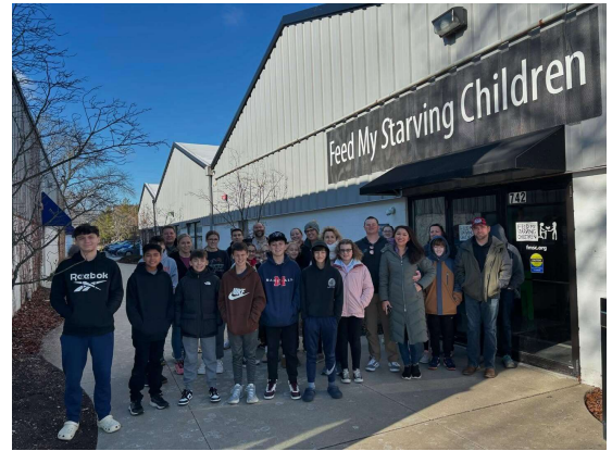
Angel Tree Ministry