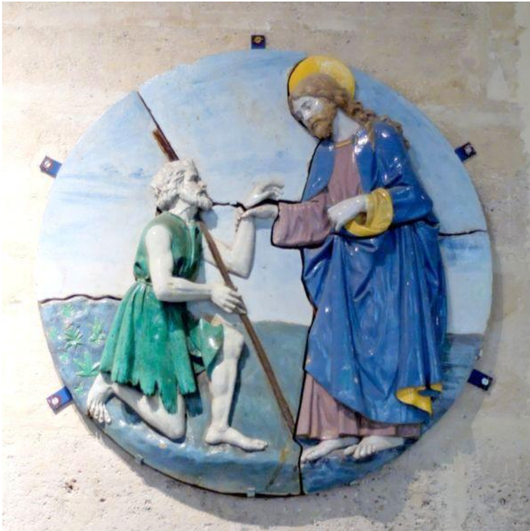
Christ Comforting a Poor Man – by Luca della Robbia 1484-1519, clay plaque, in the Louvre, Paris, France

The Zoom codes for all our worship services are: