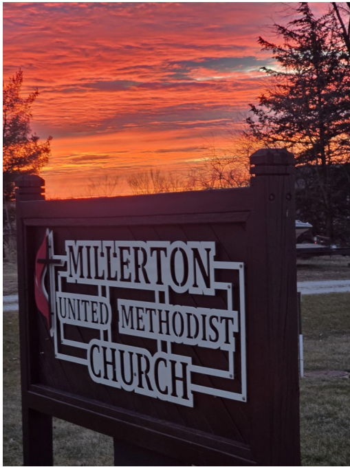
Row 1 Left: God's beautiful sunrise Row 1 Right: Christmas candle light service at Corydon Specialty Care