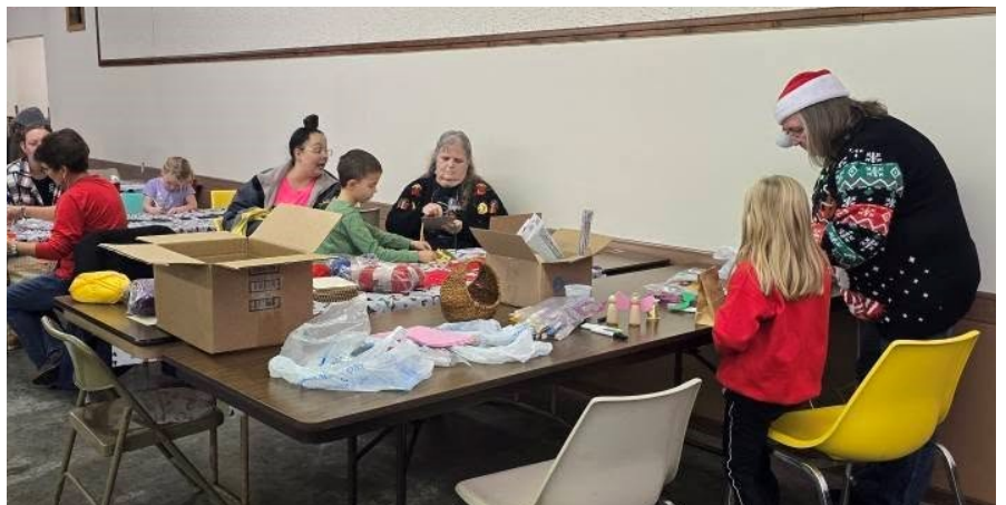
Row 2: Community Christmas party at Lineville Row 3 Left: New Zion UMC cookie making Row 3 Right: Lineville UMC current quilt