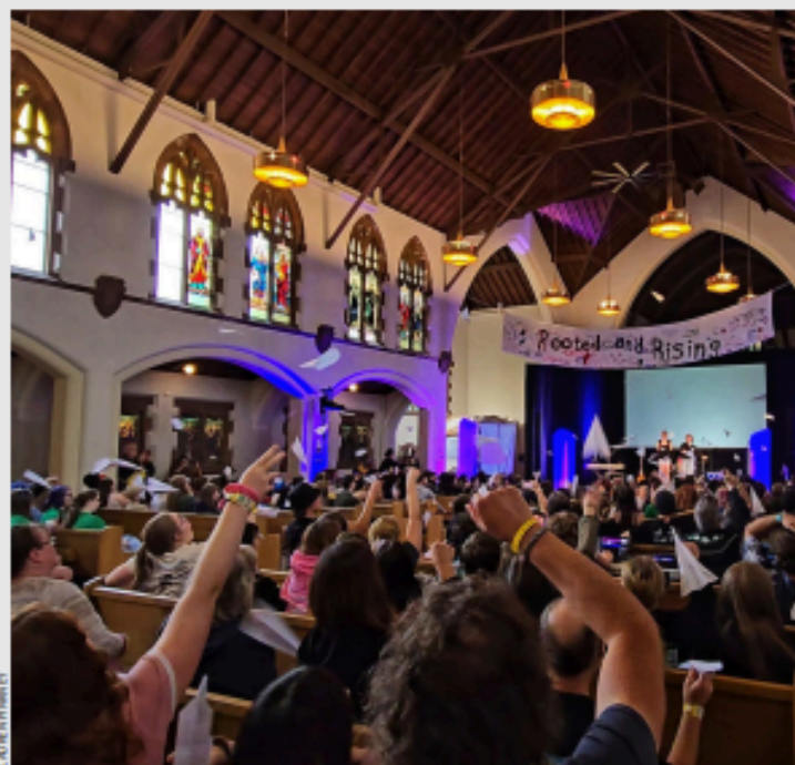
Youth gathered to deepen their faith at CLAY 2025.