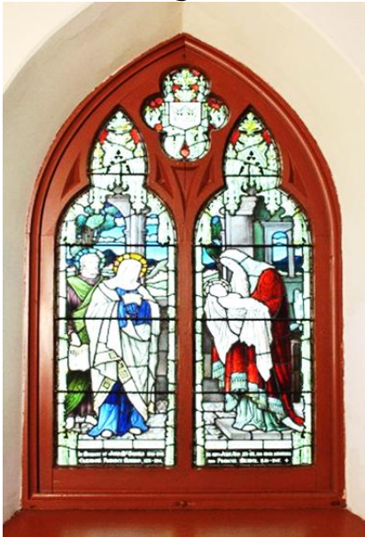
Presentation of Our Lord window at Christ Church Meaford

Please join us SUNDAY for In Person Worship