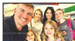
And soon we will be a family of SEVEN!