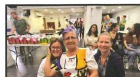
One of 1,800 happy faces upon receiving glasses and the Gospel!