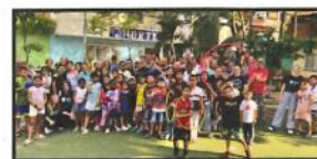
Our nonprofit ministry, Refugio Vida, is going splendidly! (Ask us how you can bless one of our kids this Christmas)

"Now unto him that is able to do exceeding abundantly above all that we ask or think, according to the power that worketh in us, Unto him be glory in the church by Christ Jesus throughout all ages, world without end. Amen." — Ephesians 3:20-21