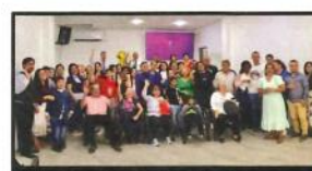
We were honored to join Esperanza (Hope Baptist Church) to celebrate its first anniversary in September.