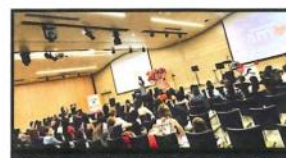
Our women's ministry leaders did a great job organizing this year's event!