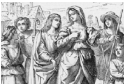
Christiana would have her neighbour with her.

CHRIST. Well, Mercy, said Christiana, cast in thy lot with me; I well know what will be the end of our pilgrimage. My husband is where he would not but be for all the gold in the Spanish mines. Nor shalt thou be rejected, though thou goest but upon my invitation. 1 The King, who hath sent for me and my children, is one that delighteth in mercy. Besides, if thou wilt, I will hire thee, and thou shalt go along with me as my servant. Yet, we will have all things in common betwixt thee and me; only, go along with me. 2