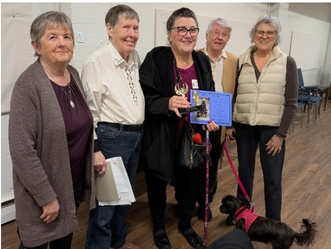
St. Andrew's award for tree at Festival of Trees

Photos from January 2026