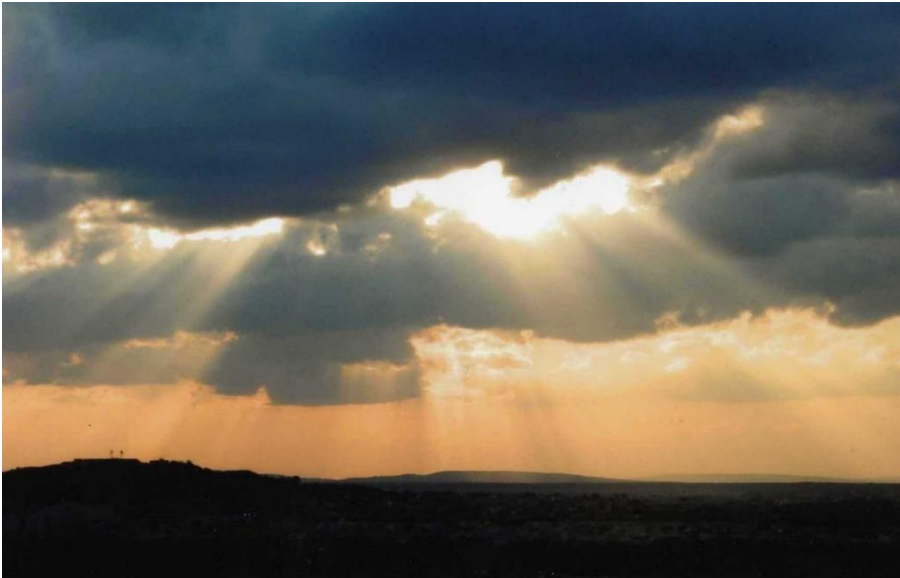
Australia, Perth Coastline, 2009

'Land of Zebulun, land of Naphtali, on the road by the sea, across the Jordan, Galilee of the Gentiles— the people who sat in darkness have seen a great light, and for those who sat in the region and shadow of death light has dawned.'