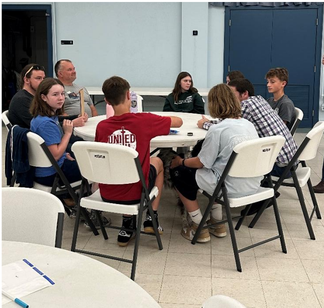
Pictured BELOW – Synod Youth at the Murder Mystery event on October 12 th at St. John's.