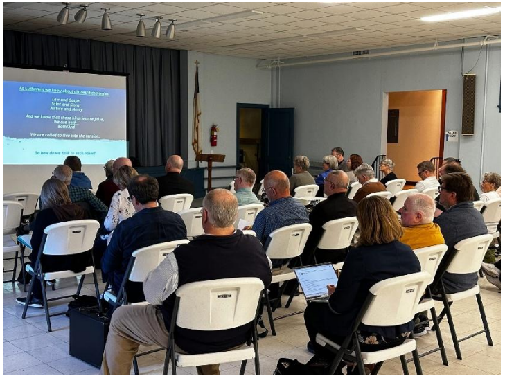
Pictured ABOVE – Bishop's Day held here at St. John's on October 2 nd .