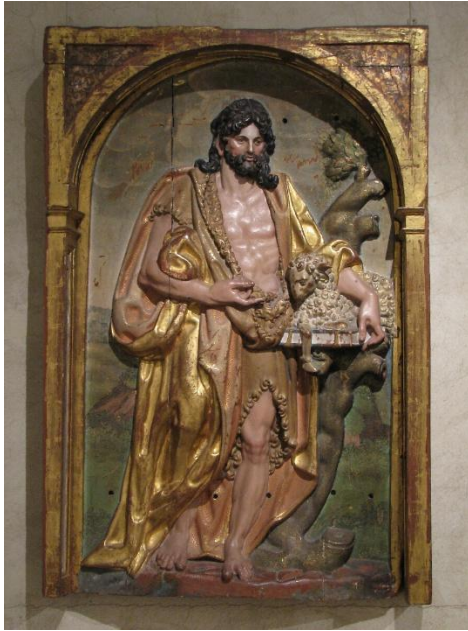
Saint John the Baptist; Juan de Ancheta Spanish ca. 1580–92

Please join us SUNDAY for In Person Worship