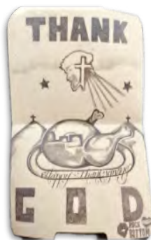
An inmate's drawing shows his appreciation for the Turkey Drive.

This past quarter made it impossible to select one community partner! RBCM is thankful for ALL of those who offered support. Whether it was prayer, donated turkeys, toys, jackets, cases of Bibles, books, funds, vehicles, hosting a drop location, or simply dedicating time for the sake of building relationships, we are grateful! Mostly we are thankful for your prayers and continued prayers over the ministry. God continues to reveal Himself through the willing. Thank you and God bless you!