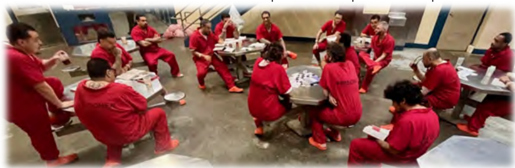
The men having a Bible Study

NJ4F is otherwise known as North Jail, 4th floor, pod F. It's fair to say, anyone going to jail as an inmate would be blessed to end up here. God is present in this place.