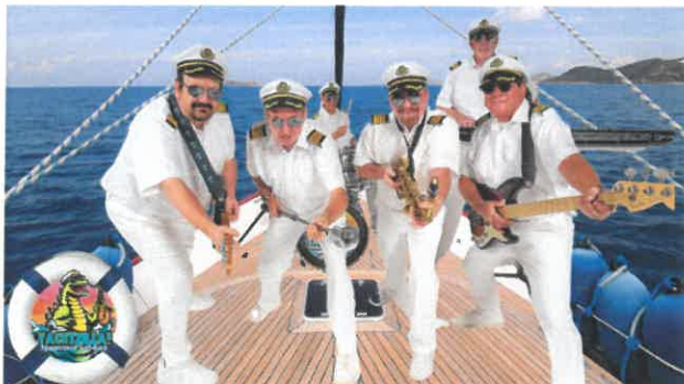
YACHTZILLA FEBRUARY 20TH

Get your tickets today after service or in the Administrative office during normal business hours.