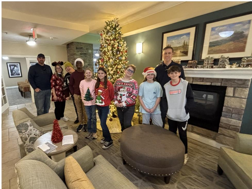
Our carolers went and visited the homebound yesterday and sang an arrangement of Christmas Carols.