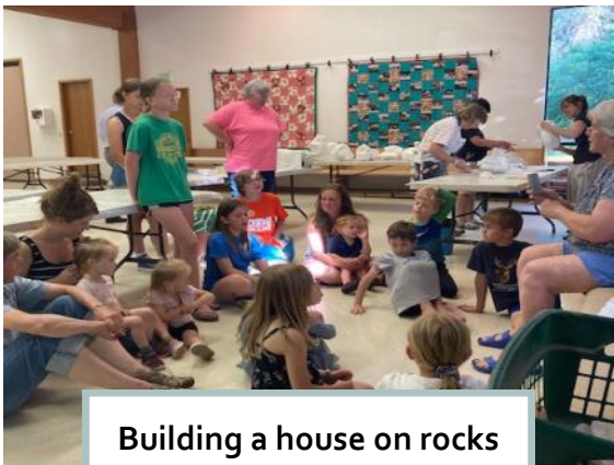
Building a house on rocks or sand