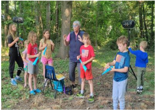
Storytime with Music & Motion