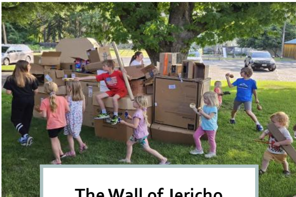
The Wall of Jericho