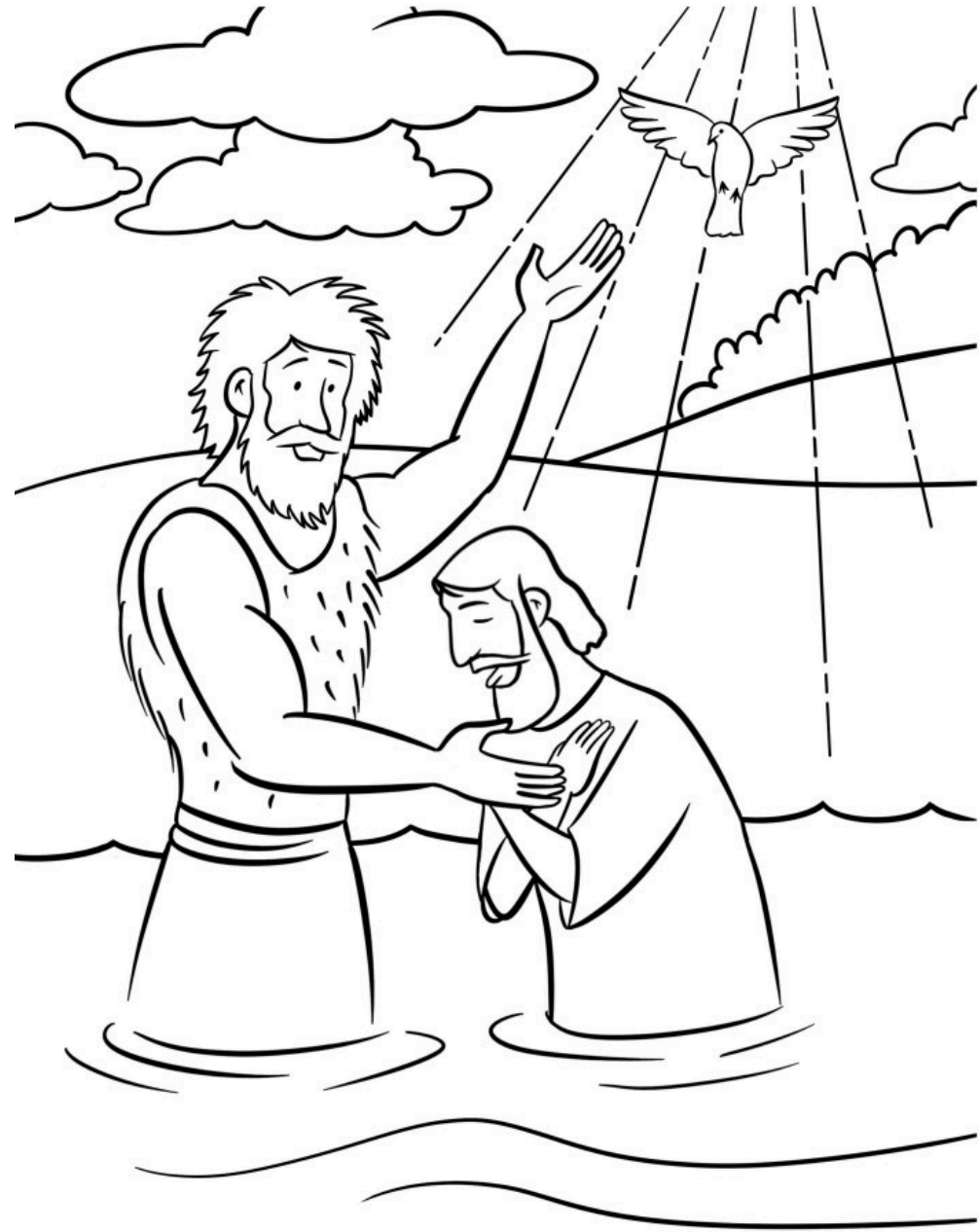
John Baptizes Jesus