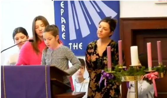
Week 1 – Hope