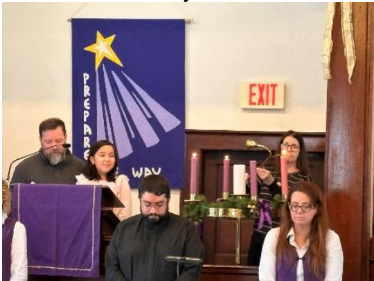
Advent Week 3 – Joy