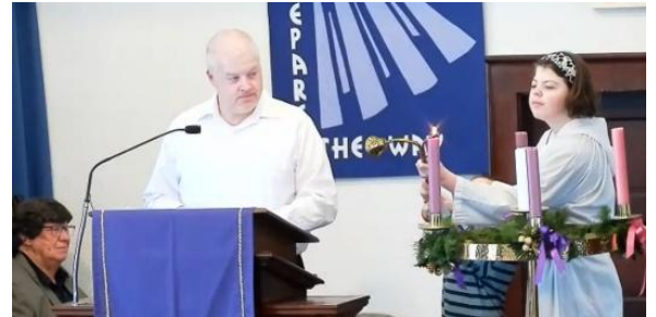
Advent Week 2 – Peace