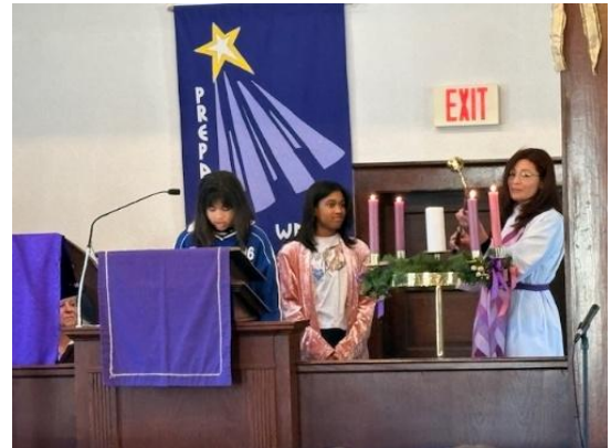
Advent Week 4 – Love