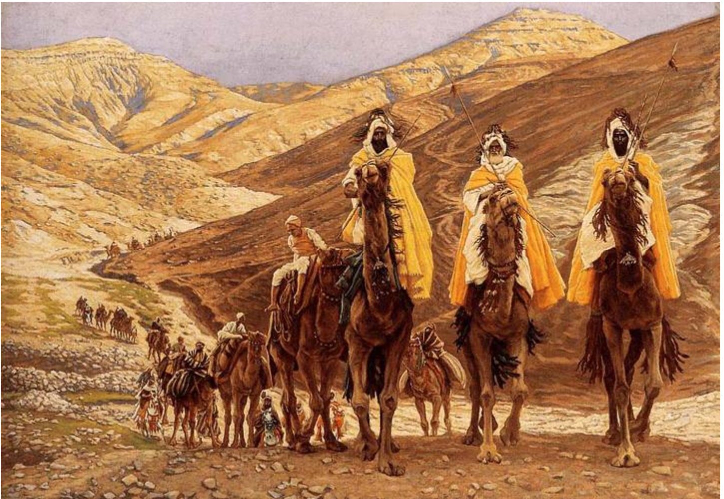
Tissot, James, 1836-1902. Journey of the Magi, from Art in the Christian Tradition , a project of the Vanderbilt Divinity Library, Nashville, TN. https://diglib.library.vanderbilt.edu/act-imagelink.pl?RC=56277 [retrieved December 31, 2025]. Original source: https://commons.wikimedia.org/wiki/File:Magi_tissot.jpg .

We are an inclusive and affirming parish; the sacraments of the church (baptism, communion and marriage) are available to all people on equal terms. Christ welcomes you, and so do we.