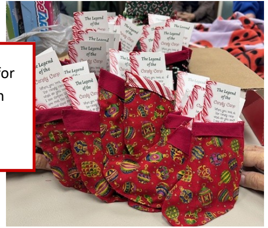
Stockings for children on Christmas Eve!