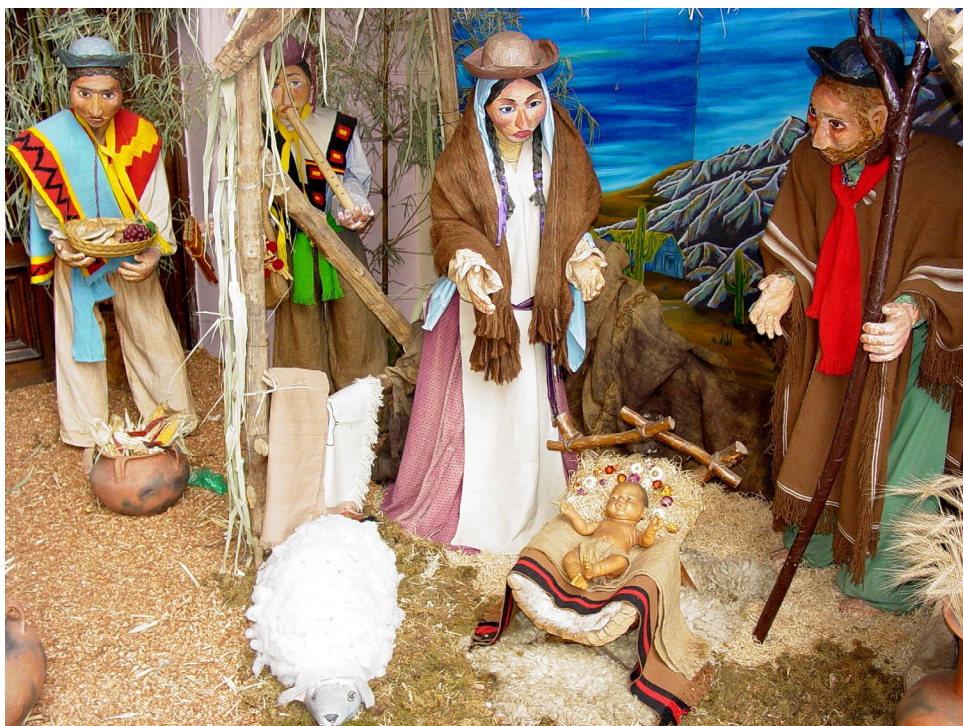
Andean Nativity Scene Salta, Argentina, 2003