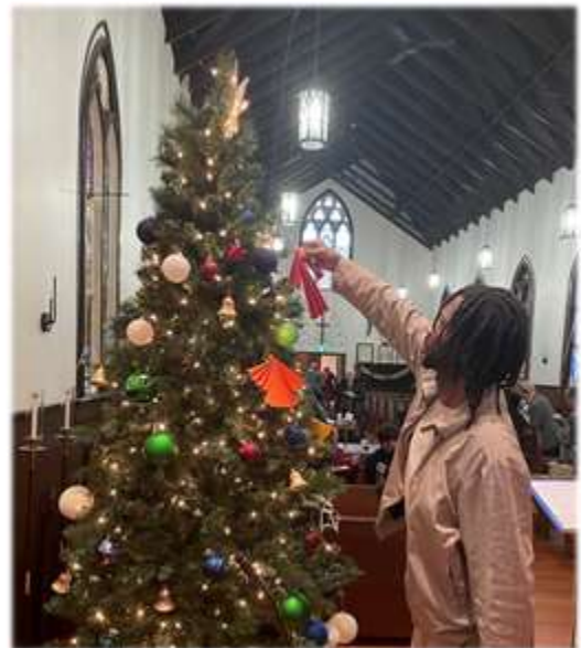
Decorating the Christmas Tree in the church