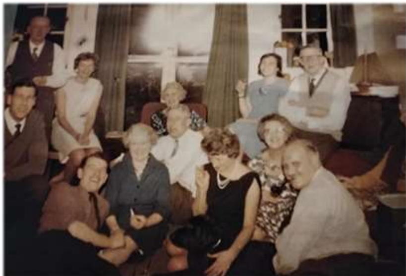
The family gathered at Christmas

I was very lucky growing up as I had quite an extended family and also lived in quite a large house, so generally every Christmas, everyone came to our house. Usually there were at least 12 family members plus a few friends.