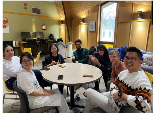
Early Dec. Staff Gathering in Guelph on the left.