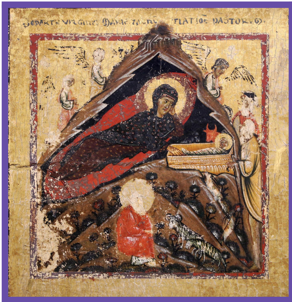
Image: Wikimedia Commons - Margaritone d'Arezzo - Madonna col Bambino in Trono e Scene Religiose, 1263-64 - CC BY 3.0