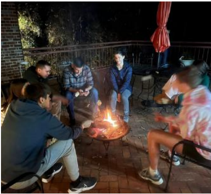
Participants of EYC enjoyed capture the flag and a bonfire.