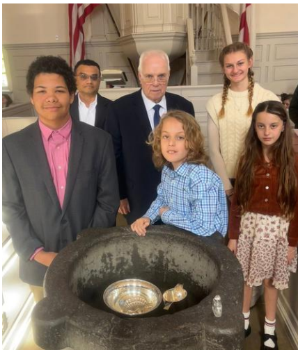
We celebrated several baptisms in November.

As his disciples in the world today, we can never forget that our Lord has chosen his church (us), to be the vessels through which his transformative light reaches this dark and lost world. Advent is indeed a call to action. Like the bridesmaids in Jesus' parable from Matthew 25, we are called to keep our lamps trimmed and burning for the Lord. Through our words and actions, we are to be heralds of the gospel and ambassadors for Christ at all times and in all places. Advent is a time to recommit ourselves to this important calling.