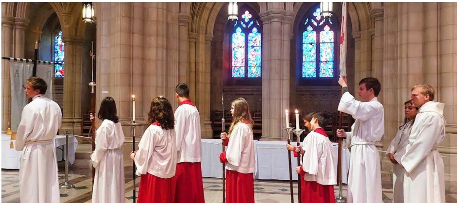
Our Acolytes had a great time representing Pohick at the Washington National Cathedral for the National Acolyte Festival!