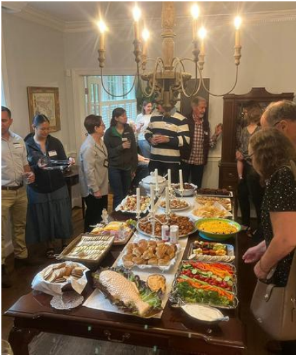
A dinner at the Rectory