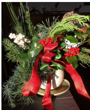
5" Table Pot $15

Payment this Sunday can be made by cash, debit, credit card or e-transfer. If you won't be at church this Sunday, visit the Glacier Grannies website for other ways to order your door swags and table pots.