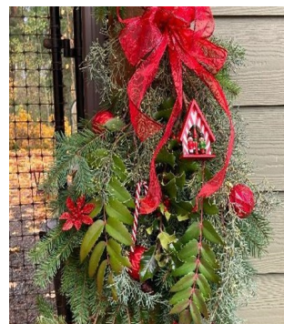
Door Swag $25

Stephen Lewis Foundation's Grandmothers to Grandmothers Campaign .