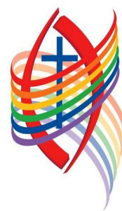
Crest of Affirm United

For more information about our faith community, see comoxunitedchurch.com