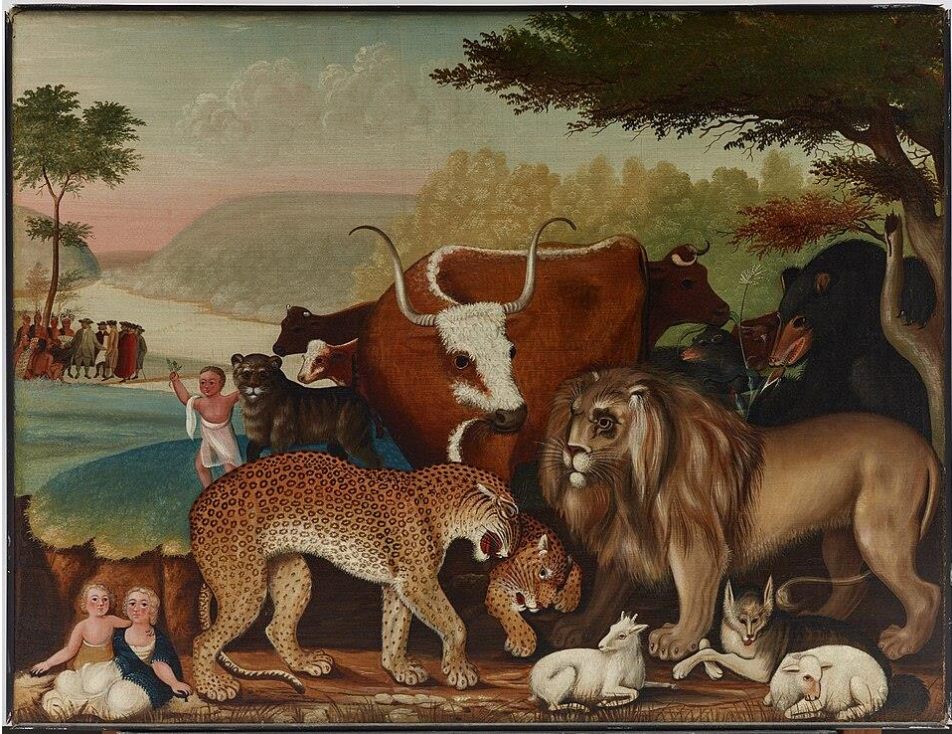
The Peaceable Kingdom, by Edward Hicks (circa 1846)