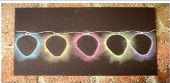
Chalk Stenciled Christmas Light Art