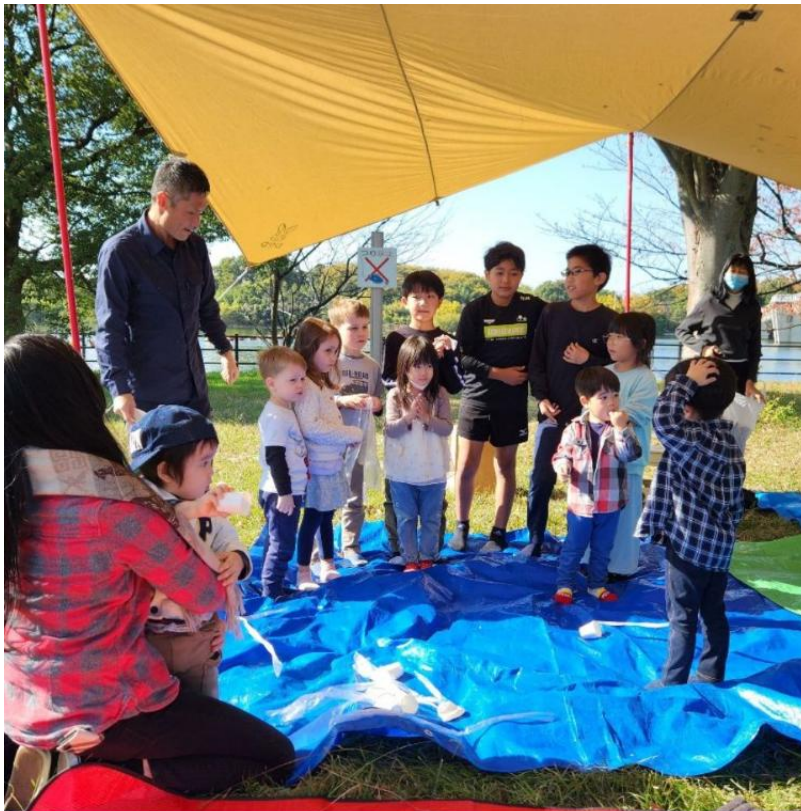
Our church held a special kids' appreciation service in a local park

November was a busy month for our family with several appointments and meetings. On top of the many hours each week we dedicate to language study, we found ourselves travelling on the weekends. Many of you prayed for our planned visit to Otawara. The congregation and church planters there greeted us warmly and we got to practice our Japanese while learning about life and ministry in rural Japan. Outside of large cities like Tokyo or Osaka, Japan can be a different place with an aging population and more traditional ways of thinking and living. Many have told us that the soil is even rockier and more resistant to the gospel. Nevertheless, the church planting pastor we visited has spent his life steadfastly proclaiming the gospel and has been used by the Lord to plant four churches to date. Please continue to pray for us as we consider this partnership.