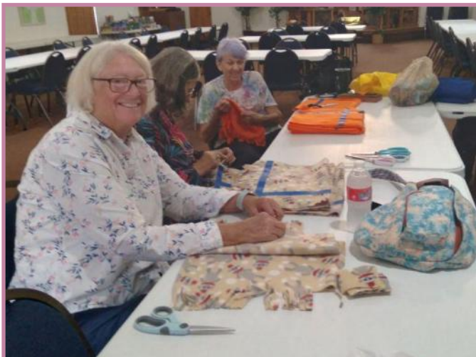
The Bethlehem Chapeau Team are pictured below assembling hats and visors for Operation Christmas Child