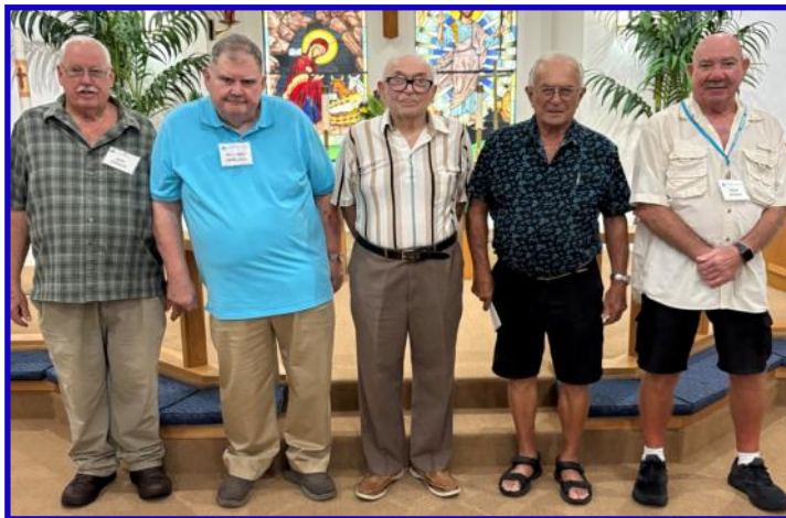
Some of Bethlehem's Veterans