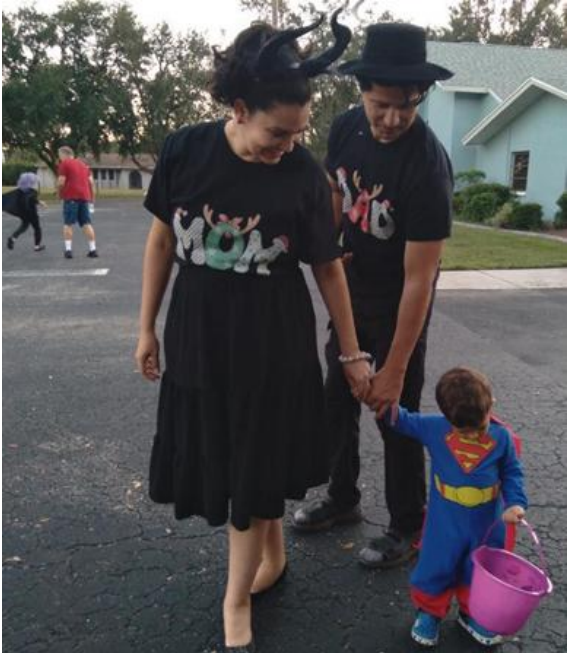
Costumed visitors at Bethlehem’s Trunk or Treat on Halloween

May God Bless Each One of You As We Celebrate Your Special Day!