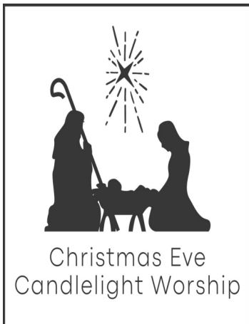
Christmas Eve Candlelight Worship