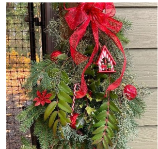
Door Swag $25

Stephen Lewis Foundation's Grandmothers to Grandmothers Campaign .