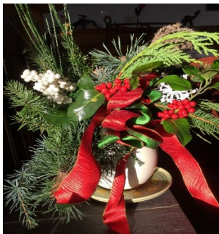
5" Table Pot $15

Payment this Sunday can be made by cash, debit, credit card or e-transfer. If you won't be at church this Sunday, visit the Glacier Grannies website for other ways to order your door swags and table pots.