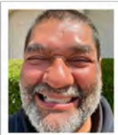
Fresh New Teeth