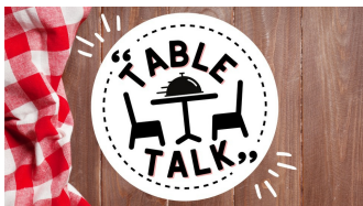
Table Talk - Wednesday Evenings