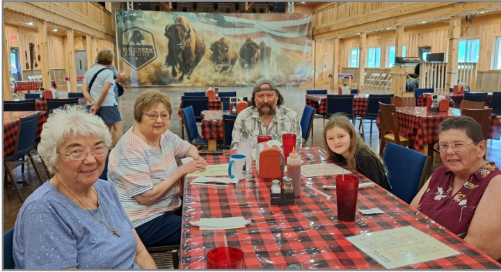
July 17th Mid Day Fellowship Mystery Trip Mud Creek Bison Ranch in Savona