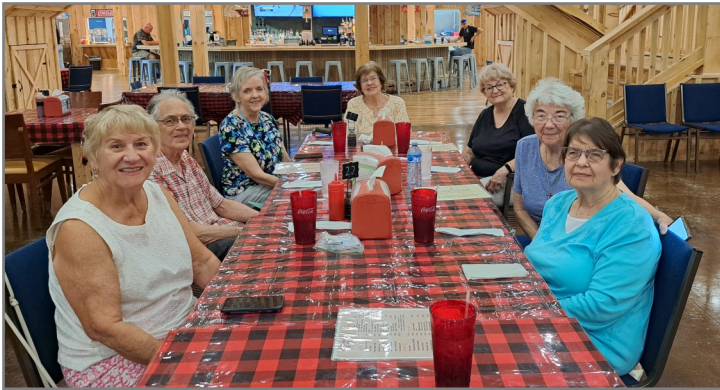
Enjoying our first luncheon on the new pergola!