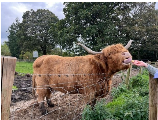
A Highland Cow, of course!