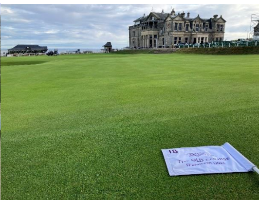
Old Course 18th Green