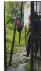
Phase 1 100K Goal - Land Purchase