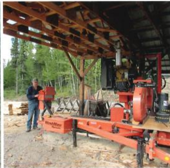
Operating the sawmill