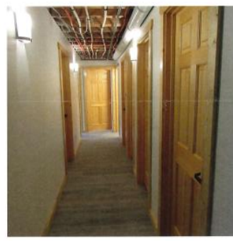
Interior doors at triplex