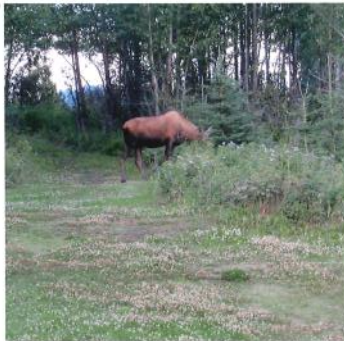
Frequent visitor at my cabin

P.S. The bottom floor of the triplex that I was working on is to house volunteer work groups and possibly some flight students.