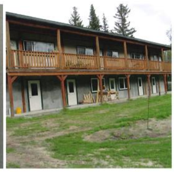
Exterior trim of the bottom floor of triplex