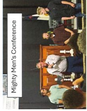
Mighty Men's Conference