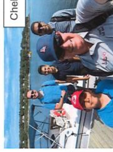
Chebeague Island Ministry