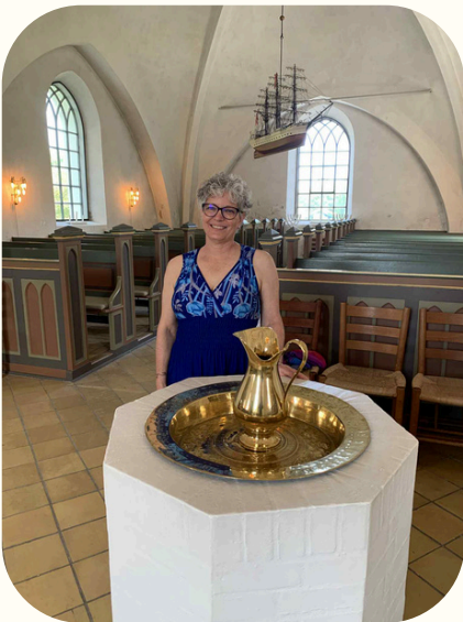
PL stands beside the baptismal font where her grandfather (and several previous generations) were baptized in 1907– yes, it's the same bowl and ewer! Notice the ship hanging from the ceiling– this church was built by Vikings in the 12th century. Jordløse, Fyn, Denmark