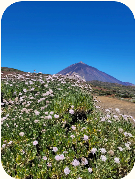
View toward Mount Teide as we ascended to it, Tenerife, Canary Islands, Spain