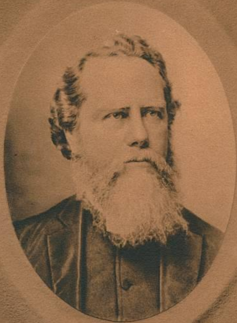
J. HUDSON TAYLOR 1832 - 1905

“God's work done in God's way will never lack God's supply.”