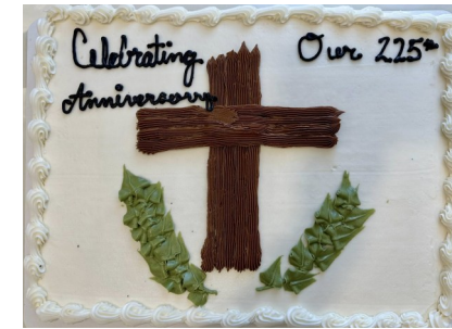
(Cake by Lowe's Foods, Wilkesboro)