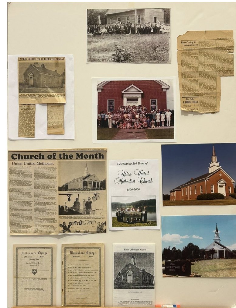
(Representation of the past – 1800 to Present Day Union UMC)